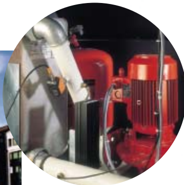
Picture taken without thermal insulation (standard feature)